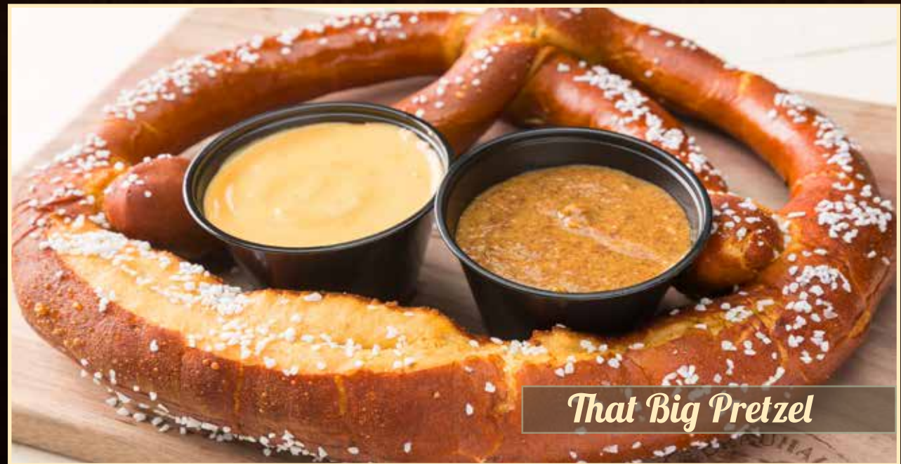
That Big Pretzel

Additional Gator's Own Bleu Cheese or Homemade Ranch – Small - $.59 Large - $.99 All Flats or Drums add $.10 per wing